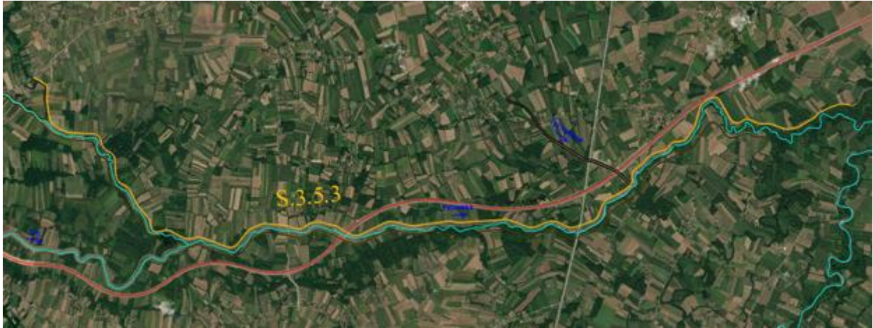
Figure 3. Embankments along the left bank of the Tamnava

The May 2014 flood clearly indicated that the territory of the municipality of Obrenovac is under very high flood risk despite the existing protection system. Due to inadequate height and size of the flood protection structures, overflowing and collapse of embankments on the Kolubara and the Tamnava rivers may occur again.